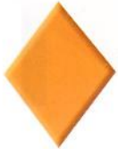
5. a diamond