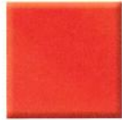
2. a square