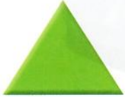
1. a triangle