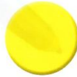
3. a circle