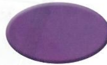
7. an oval