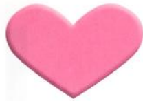
6. a heart