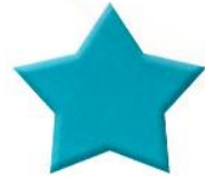
4. a star