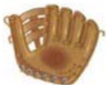
1. a mitt