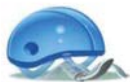
4. a helmet