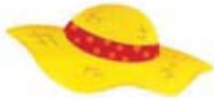
2. a hat