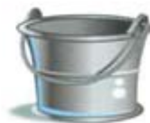
8. a bucket