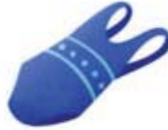
3. a swimsuit