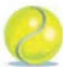
5. a tennis ball