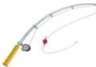
7. a fishing rod