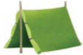
4. a tent