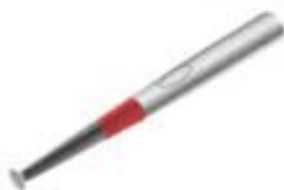
2. a bat