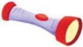
5. a flashlight