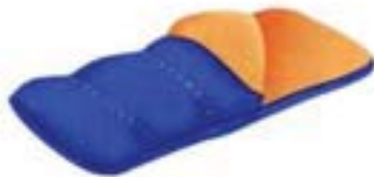
6. a sleeping bag