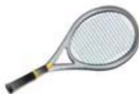
6. a tennis racket