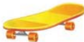
3. a skateboard